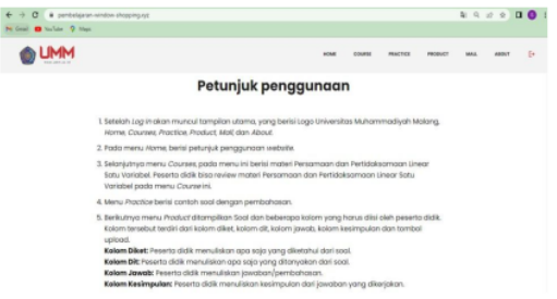
Figure 8. User guide in home menu

Furthermore, in the "COURSE" menu, as shown in Figure 9, students discovered the basic competence and learning objectives and materials. The linear equation and linear inequality in one variable topic were presented as learning videos. The videos, as shown in Figure 10, comprise five discussion videos. The first video discussed the definition of linear equation in one variable; the second video discussed the solving of linear equation in one variable; the third video described the application of linear equation in one variable in math problems; the fourth video elaborated the solving of linear inequality in one variable; and the last video discussed the application of linear inequality in one variable in math problems.