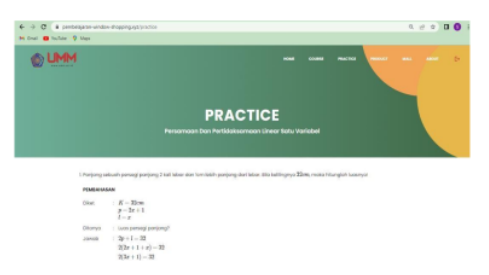
Figure 11. PRACTICE menu

The following menu is "PRACTICE," as shown in Figure 11. Where, students are able to study the examples of math problems and their discussions on the topics of linear equation and linear inequality in one variable.