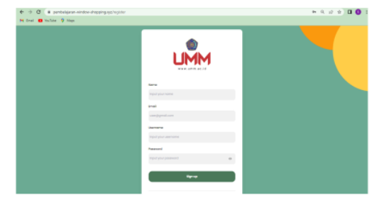
Figure 5. Create new account

In this stage, the WBWS learning model was examined. Students clicked the Create New Account button on the login page and filled in their name, email, username, and password, as shown in Figure 5.