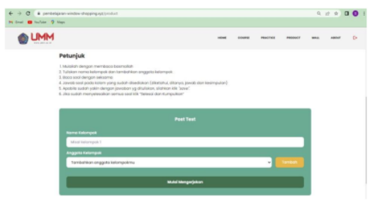
Figure 12. PRODUCT menu

In the "PRODUCT" menu display, as shown in Figure 12, the students filled in their group and member names and clicked the "Start Working" button.