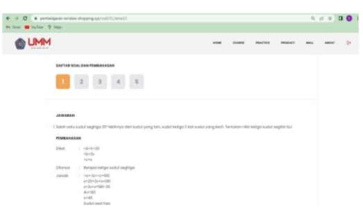
Figure 15. Students' work results in MALL menu

Once one of the groups' icons was clicked, the results were displayed, and students were allowed to post comments, ask questions, and give suggestions on each answer, as shown in Figure 15.