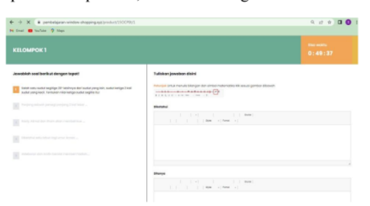
Figure 13. PRODUCT menu in the math problem-solving

Afterward, the students located the questions on the left side of the screen and columns of answers comprising key details, objective, answer, and conclusion on the right side. They found the same answer format for each question after they reached the last question. After answering the last question, they had to click the "Finish and Submit" button to upload their product, as shown in Figure 13.