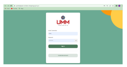
Figure 6. Sign in

Students logged in with existing accounts by filling in their credentials and clicking "Sign In," as shown in Figure 6.