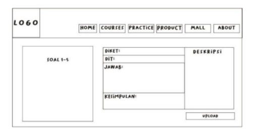
Figure 3. Storyboard of PRODUCT header

In the "PRODUCT" header, a math problem is displayed, and students are tasked to solve it. They can submit their works by clicking the "UPLOAD" panel at the bottom part of the page, as shown in Figure 3.