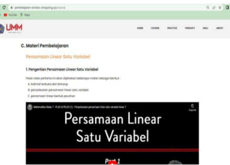
Figure 10. Learning material in video

The following menu is "PRACTICE," as shown in Figure 11. Where, students are able to study the examples of math problems and their discussions on the topics of linear equation and linear inequality in one variable.