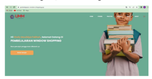
Figure. 7. Home

The students were provided with several menus on the homepage, including HOME, COURSE, PRACTICE, PRODUCT, MALL, and ABOUT, as shown in Figure 7. The "HOME" header contains a website user guide, as shown in Figure 8.