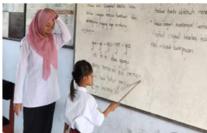
Figure 1. Student Read Sentences

oral tests and written tests. The teacher stated that the initial reading and writing skills of grade 1 students at SDN Mlaten 1 were relatively good, there were only 2 students who had low MMP abilities. More than 90% of students are proficient at reading, but there are still many students who still experience difficulties and are unable to write at the beginning. This can also be seen from the results of observations when learning activities take place. Students are able and fluent when asked by the teacher to read the sentences on the board.