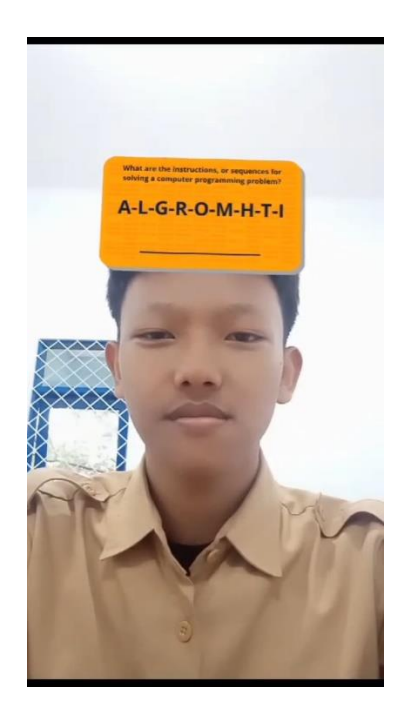
Appendix 4 Documentation of The Users of Instagram Filter