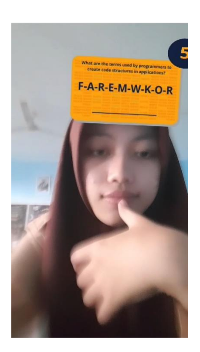
Appendix 5 Pre-test and Post-test questions

Pre-Test & Post-Test: Vocabulary of Software Engineering