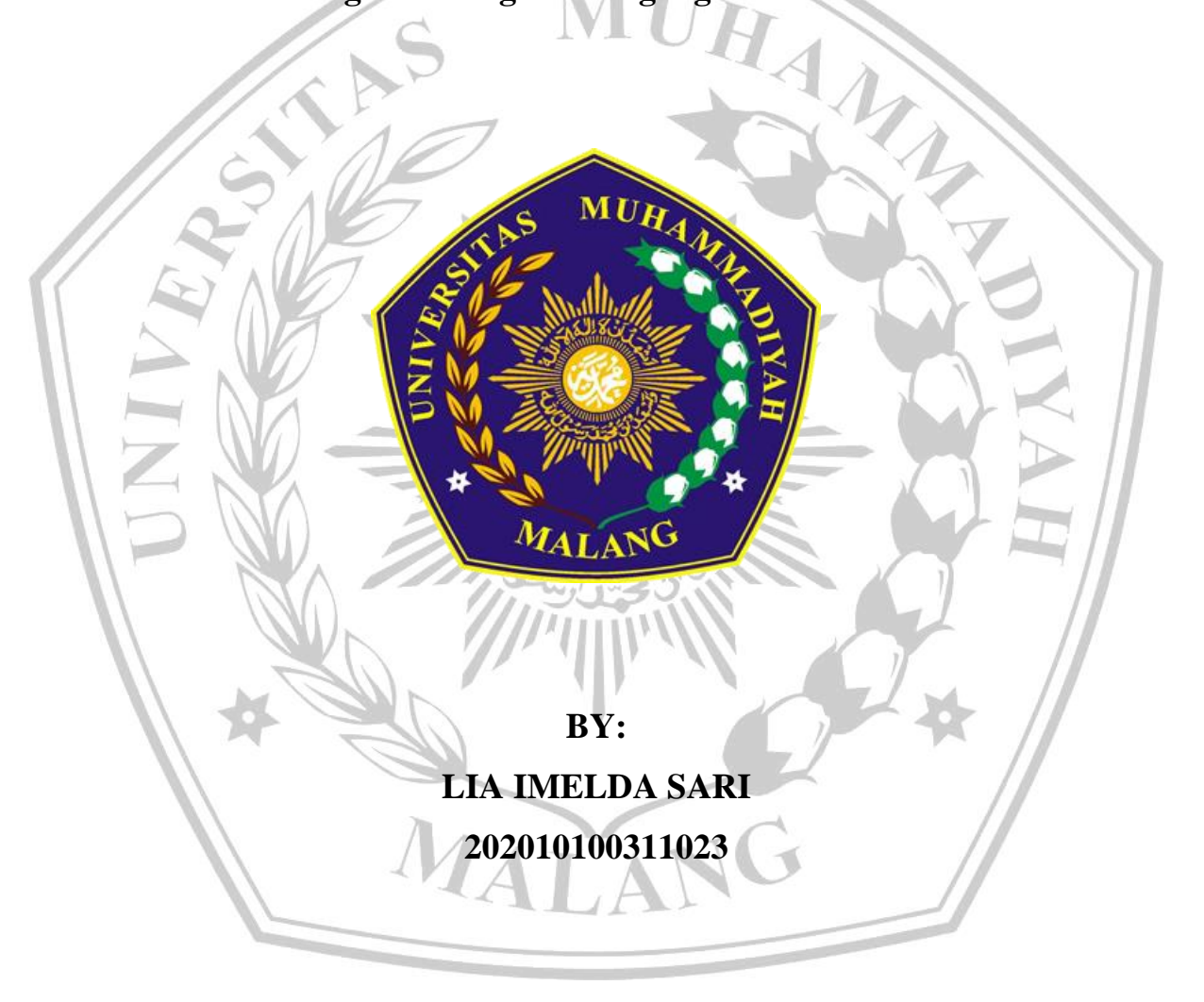
THESIS This thesis is submitted to meet one of the requirements to achieve Sarjana Degree in English Language Education

ENGLISH LANGUAGE EDUCATION DEPARTMENT FACULTY OF TEACHER TRAINING AND EDUCATION UNIVERSITY OF MUHAMMADIYAH MALANG 2024