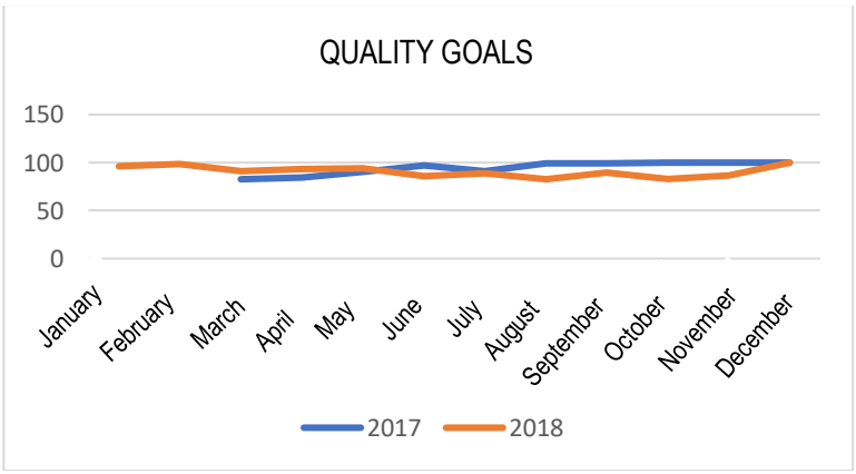
Figure 1. Graph of Quality Goals (PT. Galic Bina Mada, 2018)

Each section / department at PT Galic Bina Mada had different quality goals. The determination of quality objectives was in accordance with the relevant functions and processes required in the quality management system. The setting of these quality objectives must be consistent with the quality policy and can be measured by taking into account the applicable requirements, and relevant to the suitability of products and services in increasing customer satisfaction. Quality target reporting was carried out once a month by each department. The result of 2017-2018 quality goal achievement is shown in Figure 1.