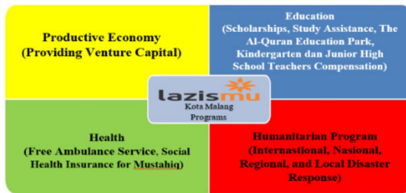
Figure 2. Malang City Lazismu regular program in utilizing Islamic Philanthropy funds.