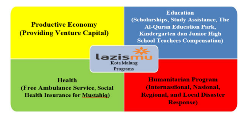
Figure 2. Malang City Lazismu regular program in utilizing Islamic Philanthropy funds.