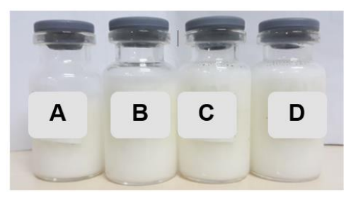
Figure 1. NLC systems (A) formula 1; (B) formula 2; (C) formula 3; (D) formula 4

The organoleptic observation showed that the NLC was white, odorless, had a liquid consistency and soft texture, as shown in Figure 1.