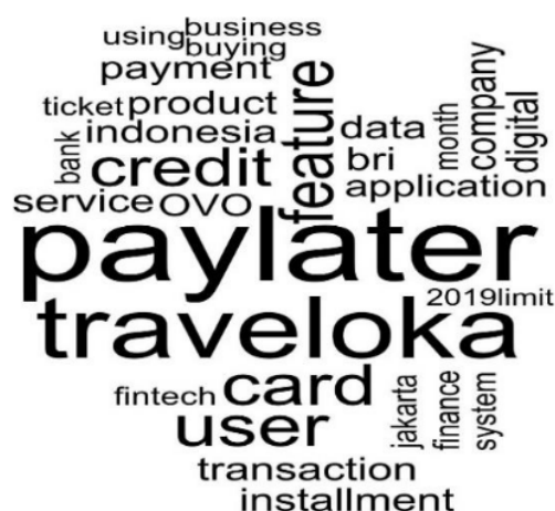
Figure 1. Word Used by Online Media in Pay later System in Indonesia

means consumer can buy today and pay it later. Although this word is adopted from other language, it shows that consumer in Indonesia becomes familiar with this term. Online media also captures that Traveloka, which is one of the famous start-up companies in Indonesia, is the company that has significant connection to pay later system. This result is unsurprising due to the implementation of pay later in Indonesia that Traveloka has pioneered. As a start-up company that focuses on online travel agent, Traveloka realizes that the market opportunity in travel and tourism industry becomes wider. However, not all of their target consumers have sufficient funds to buy flight tickets or other offered products. It drives this company to apply pay later payment system since 2018 as the solution for their consumers. Currently, other companies' like Gojek, OVO and Shopee also offers the same system.