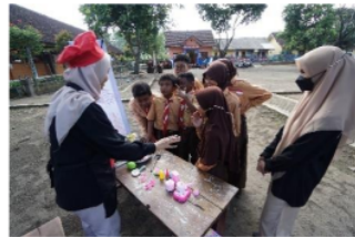
Figure 6. Chef 's