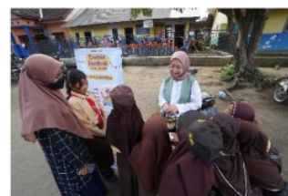
Figure 4. Businessman