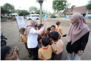
Figure 5. Doctor