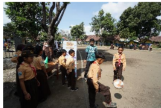
Figure 8. Athlete

Along with the implementation of career introduction in each corner for students in grades 4,5,6, there was a "career festival: my dream job" for students in grades 1,2,3 in the library hall of SD Negeri 1 Jambesari. The activities carried out were the screening of animated videos introducing various professions, from doctors, police, TNI, teachers, content creators, and other professions. In addition, there are coloring activities that aim to train the creativity of grade 1, 2 and 3 students. It is in line with the work of Farah et al (2021) who developed textbook activities for primary graders by considering kinesthetic activities as a way of attracting students' engagement. In addition, Er (2013) affirms that the use of Total Physical Responses is the best approach to teach students learn a language.