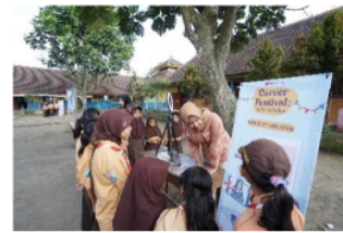
Figure 7. Content Creator