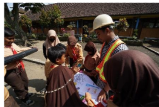
Figure 3. Architect