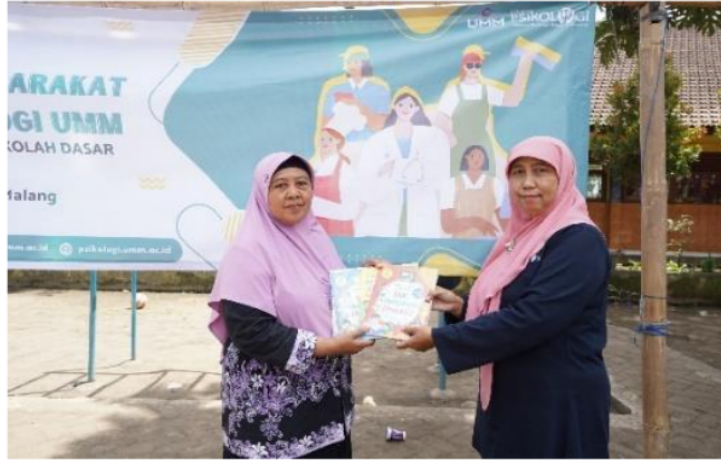
Figure 10. Giving Souvenir for representatives of SDN 1 Jambesari

After carrying out the career festival activities: my dream job, the team gave a souvenir to the school as a memento (Figure 10).