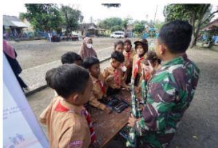
Figure 2. Army (TNI)

Students who initially did not know directly about the use of the tools used by each profession, through this activity they obtain many information about careers (Figure 2 to Figure 8), for example (ring lights, tripods for content creator profession; drafts of building drawings in the architect profession; army clothes in the civil service profession; how to present or product promotion in the entrepreneurial profession; stethoscope and thermometer in the medical profession, new knowledge related to the professionalism of a "cook" who works in hotels, restaurants, etc.; as well as direct demonstration of the tools used by football athletes). As well as information that obtained by the students, hopefully they can make a best decision for their future. Students can improve their career decision making using career guidance and counseling strategies or by alternatives services to get more information about careers (Akhmania et al., 2021).