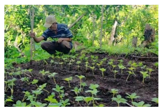
Figure 3. Porang Cultivation with Bulbil/Frog seeds

The porang plant has great potential to be cultivated, either in processed raw form or in the form of processed products. Indonesia has exported many porang plants to foreign countries such as Japan, Korea, and China. Currently, porang tubers are shipped in semi-finished form, such as making chips, which shows that opportunities for cultivating porang are also increasingly wide open (Ningtyastuti et al., 2023; Nugrahaeni et al., 2021; Nurlina et al., 2023). The development of porang plants has promising prospects with high economic value; moreover, growing porang does not require technology and large capital because, with one planting, there is no need to plant seeds again (Pieter et al., 2022; Riptanti et al., 2022). Developing a porang-based agroforestry pattern is easy for farmers, and the results can meet requirements and improve welfare (Mufidah et al., 2021). Porang plants under stands will not damage or change land use and will ensure sustainable development of porang plants (A. onophyllus Prain). Porang cultivation is very promising because it is a source of income for people living near forests (Rosida et al., 2022; Sabani & Alamsyah, 2023). Cultivation of porang plants (A. onophyllus Prain) can be done by planting stands without destroying or cutting trees and utilizing empty land under the brackets (Tegakan) in agroforestry.