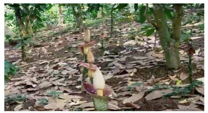
Figure 5. Protected forest

Figure 4 shows the storage of porang tubers (A. onophyllus Prain) as one way of storing large quantities of porang seeds in tubers. Storing porang tubers for development is not done by stacking porang tubers; if they are stacked, they are prone to rot because air circulation is not smooth enough. 2.7 kilograms of porang tubers can be produced for every kilogram of bulbil. Storage like this is very easy; just put it on the ground and get even air circulation and sunlight. The process of cultivating porang plants uses more porang tubers (Sugiarto et al., 2023; Supriyono et al., 2021; Wahidah et al., 2021). Cultivation of porang plants has a high potential to increase the income of the people of North Lombok Regency, which borders protected forest stands ( Tegakan ) – Figure 5.