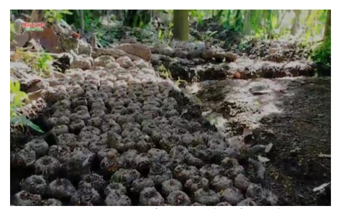
Figure 4. Storage of porang tubers for seeds

sustainability-based planting process can be applied to the cultivation of porang plants, which can be seen from an ecological aspect. Currently, the process of cultivating porang plants through community forests is felt to be slow, so this needs to be overcome by planting porang among the stands (Soedarjo, 2021; Soedarjo & Djufry, 2021). This will provide gradual additional income from his land. The opportunities for cultivating porang are very large. Moreover, porang can produce even if planted under stands and grow well and produce good tubers. The initial seeds of porang, known as bulbil/frogs, can be obtained from the forest to be further cultivated, as seen in Figure 3.