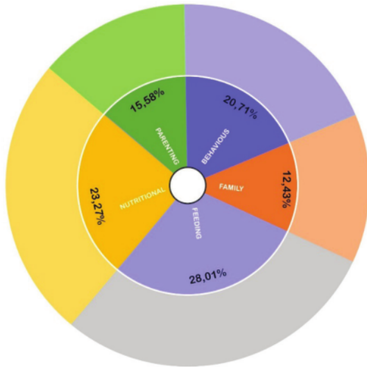
Figure 1. Hierarchy chart using Nvivo 12 Plus

Figure 1 describes six themes related to children experiencing ARFID, including parenting, feeding, behavior, family, and nutrition. The articles that explain ARFID in children are feeding, nutritional, behavior, parenting, and family (28.01%, 23.27%, 20.71, 15.58%, and 12.43%). Eighteen articles discuss feeding 18,20-36 . The feeding theme can be explained by abnormal feeding attitudes, childhood feeding disorders, or feeding problems. Strange feeding attitudes are physiological feelings of hunger or fullness. The prevalence of peculiar feeding attitudes among young children in the general population is between 10% to 25% (3). It encompasses a broad spectrum of severity that ranges from eating limited types or textures of food to having a potentially life-threatening that requires nasogastric tube feeding or other medical procedures 28 . Childhood feeding disorder in ARFID is problem behavior during meal times (i.e., verbal refusals, food avoidance, food selectivity, etc.) 30 .