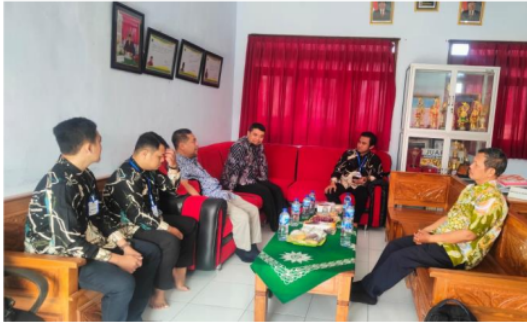
Figure 2. Discussion activities with the Principal and Deputy principal of JHS of MBS Jombang, East Java

The team held another discussion with the Principal and Deputy Principal of JHS of MBS Jombang to re-equalize perceptions about the problem, efforts to solve the problem, and the urgency of this activity for the school. Next, the plan for the activity stages will be explained, and the agreed time for carrying out activities involving teachers will be explained (Figure 2).