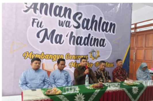
Figure 4. Scientific Writing Assistance Activities