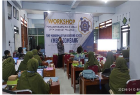
Figure 3. Scientific Writing Training