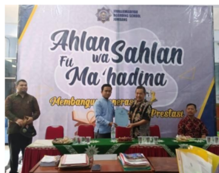
Figure 5. Symbolic handover of the MoU