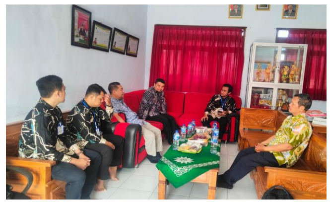
Figure 2. Discussion activities with the Principal and Deputy principal of JHS of MBS Jombang, East Java

The team held another discussion with the Principal and Deputy Principal of JHS of MBS Jombang to re-equalize perceptions about the problem, efforts to solve the problem, and the urgency of this activity for the school. Next, the plan for the activity stages will be explained, and the agreed time for carrying out activities involving teachers will be explained (Figure 2).