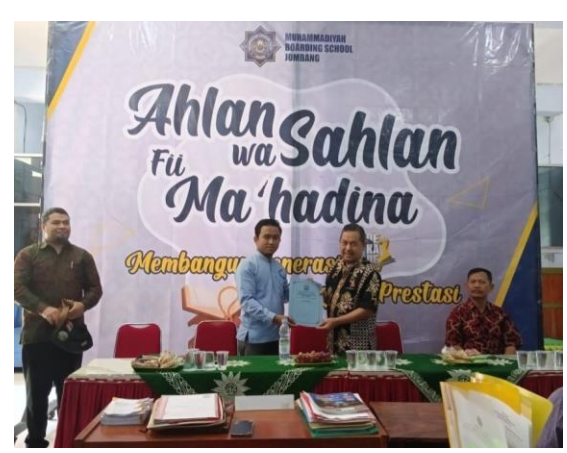
Figure 5. Symbolic handover of the MoU