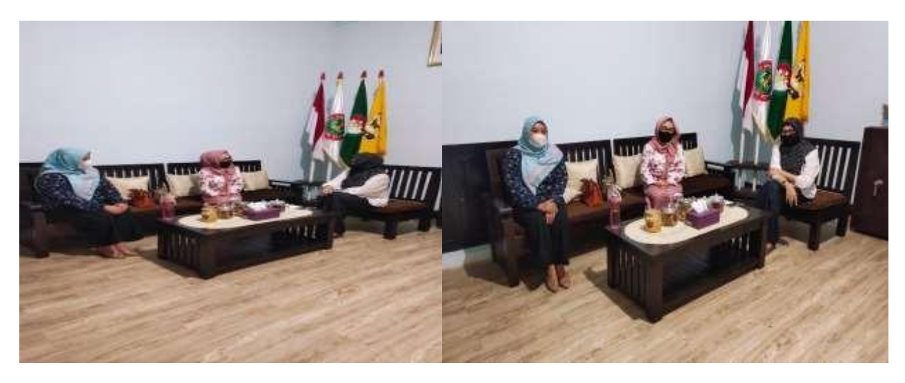
Figure 1. Coordination with the Headmaster of SMPN 04 Malang

In preparing the project, there were some activities conducted and the documents were attached in this project reports. The activities were as follows: (1) Sent a letter of agreement to the headmaster SMNP 04 to start the program (Figure 1). (2) Made an appointment to talk about the program. (3) Conducted discussion with the Head master. It was conducted at 7th, August 2020. The discussion was about to explain to the Headmaster about the program, the procedures, FGD, monitoring and evaluation, output, and reflection. Besides, the discussion was also to get the agreement of rights and obligation to both SMPN 4 Malang teachers and the teams. Herewith the documents of the discussion.