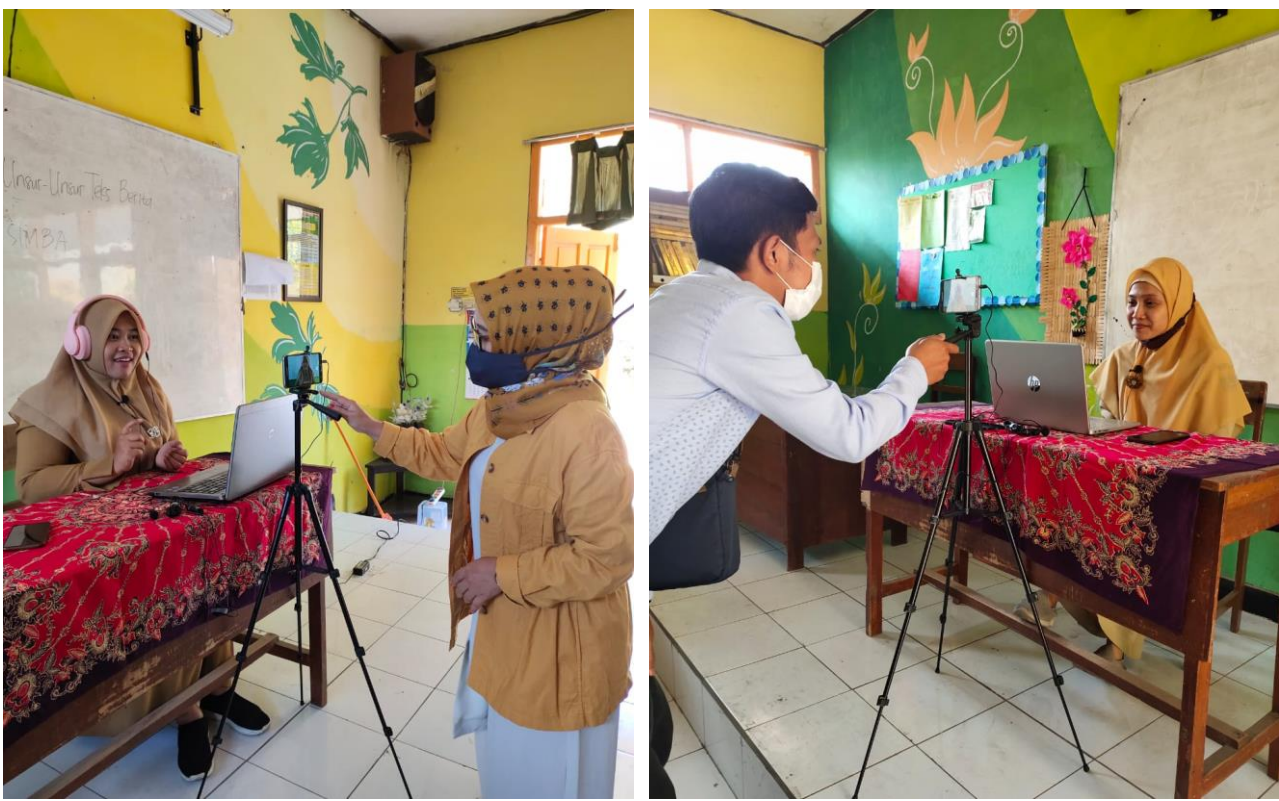
Figure 3. Process of recording the online teaching

The teaching practice was conducted in SMPN 4 Malang. There were 3 teachers who represent in the teaching practice, they were two Bahasa Indonesia teachers and one English teacher. The process of teaching was recorded and documented into a video. In teaching, the teacher used lessons plan which have been revised. After the process of editing and discussion with the teachers about the results, then the video created and uploaded into YouTube.