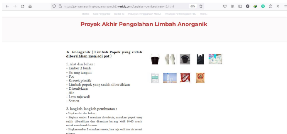
Figure 3. Student investigation activities in order to strengthen concepts