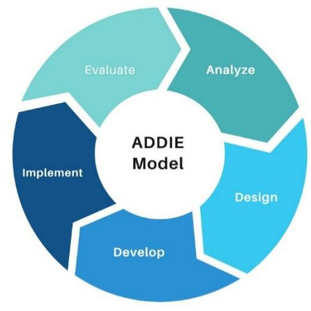
Figure 1. ADDIE model procedure

This development research uses the analysis, design, development, implementation, and evaluation (ADDIE) model as in Figure 1. The analysis stage is carried out by collecting as much information as possible about what is needed in developing learning media and knowing the needs of students or teachers in learning interaction.