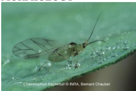
Figure 1. Alata type