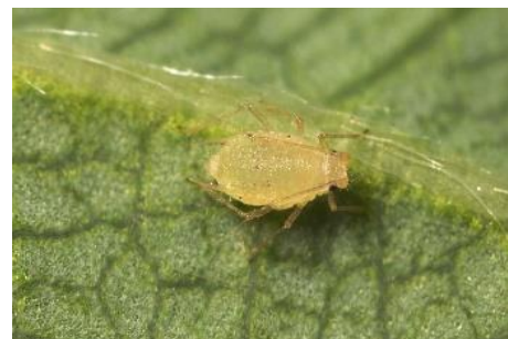
Figure 2. Aptera type

3 Review: Control of Strawberry Aphids ( Chaetosiphon Fragaefolii ; Aphididae ) Through Sustainable Natural Materials In Strawberry ( Fragaria X Ananassa ) Cultivation