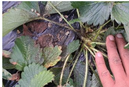
Figure 3. Symptoms of Chaetosiphon fragaefolii infestation

This pest damages plants directly by extracting their nutrients and excreting honeydew, leading to the growth of sooty mold ( Capnodium sp.) on the leaf surfaces (Foda et al., 2021). The honeydew can attract ants that use it as a food source (Maharani et al., 2020). As a result, photosynthesis and respiration in strawberry plants ( Fragaria x ananassa ) are hindered. Aphids also indirectly harm plants by transmitting viruses to them (Marianah, 2020). Symptoms of the infestation are more clearly visible on younger plants. In severe infestations, the growth becomes stunted, and the stems may twist, curl, and sometimes turn yellow (Kessek et al., 2015).