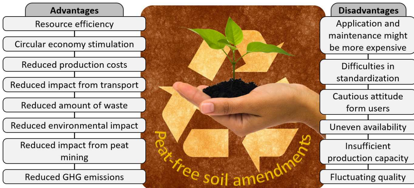
Figure 1: Advantages and disadvantages of peat-free soil-improving amendments (EC, 2018; EUBLA, 2021).

resources instead of fossil ones (such as peat is), decreasing global greenhouse gas emissions by using local resources avoiding long transportation routes (Chojnacka et al. , 2020; Klavins and Obuka, 2018; Pursula et al. , 2018).