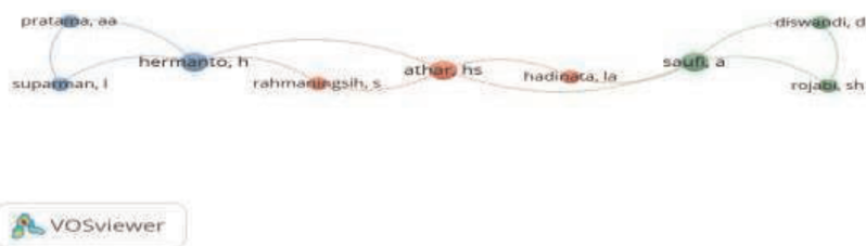
Figure 1. Author data.

The results of the author's image data show that there are three clusters formed. Cluster 1 is red which refers to rahmaningsih, s.; athar, hs.; Hadinata, la. Cluster 2 in green refers to saufi, a; diswandi, d and rojabi, sh. Cluster 3 in blue refers to primary, aa; suparman, I and hermanto, p. Cluster 1 leads to a research entitled "Inhibitors in Building Students' Islamic Characters of Halal Tourism Destination at State Senior High School in East Lombok Regency", which has been cited by another study. Cluster 2 refers to the research entitled "Developing Zero Waste Halal Tourism Community in Lombok". The research has received citations of 1. Cluster 3 refers to a study entitled "Perception of Millennial Group Business Conductors on Halal Tourism Implementation in Lombok Island" where this research does not yet have citations. The three authors above have similar research topics. The three research groups refer to research on halal tourism in Lombok.