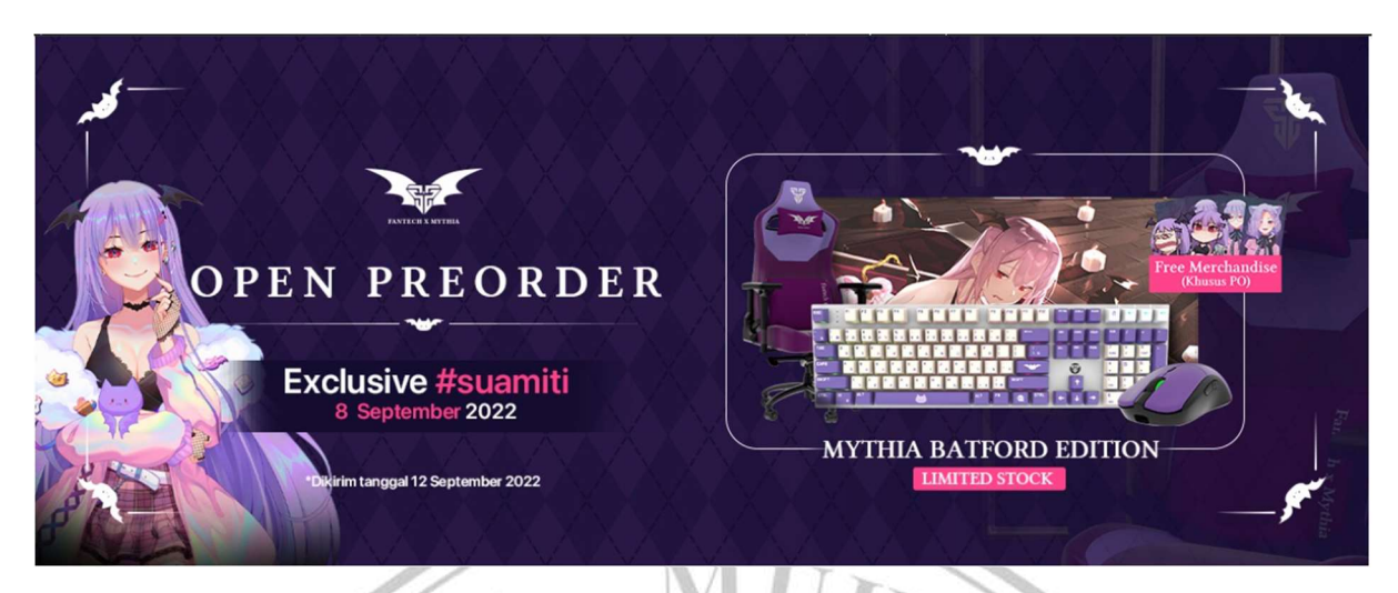
Figure 2. Fantech's announcement and call for preorders of the Fantech Mythia Edition product line