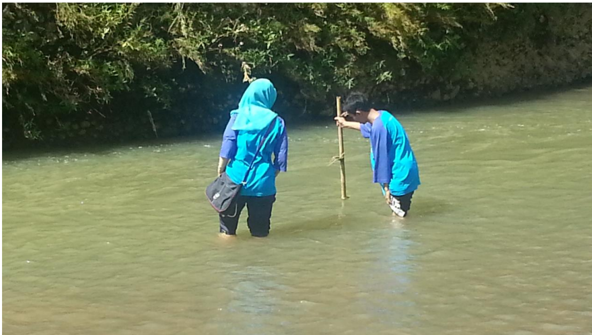
Students directly feel the river flow and measure the depth of the Brantas River in East Java