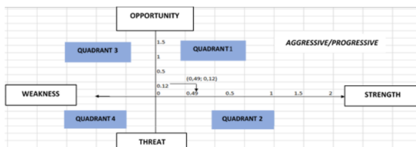
Figure 1. SWOT Diagram Analysis of Gapoktan Mulyo Santoso

Based on the calculation in table 6, the difference between Internal and External Factors of Mulyo Santoso Farmers Group Association explained that the value of internal factors on the strength indicator was greater than the weakness indicator with the difference between the two indicators was 0.49. The calculation of external factors on the opportunity indicator was also greater than the threat indicator with the difference between the two indicators that was equal to 0.12. Difference values for internal factors and external factors were used to determine the coordinates of the SWOT diagram; X axis for internal factors with a value of 0.49 and a Y axis for external factors with a value of 0.12. The results of the evaluation of internal and external factors were used as a reference in determining the location of the quadrants on the SWOT diagram, such as the following diagram: