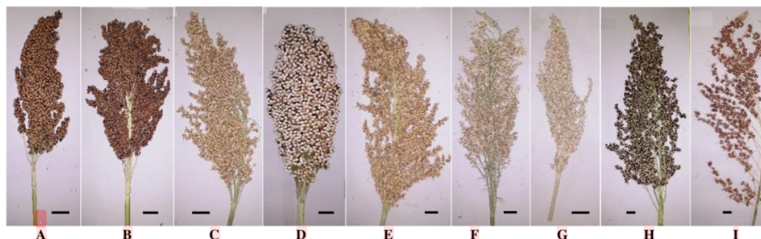
Figure 3. Seed morphology of several genotypes: A. SG-JBG, B. SG-TBN, C. SG-PSR, D. SG-LMG 1, E. SG-LMG 2, F. SG-SPG 1, G. SG-SPG 2, H. SG-TLG 1, I. SG-TLG 2. Bar = 2 cm

Long panicles of plants are formed in the primordia phase. The difference in panicle length is due to different genotypes and inherited traits. Each genetic factor and the adaptability of each variety is different so that it affects the length of sorghum panicles (Sirappa and Waas 2009). Total dry weight is one measure to study further plant growth (Ferdian et al. 2015). The total dry weight per panicle is one of the criteria for the production of sorghum. Genetic differences will result in a different panicle shape or weight of the seed unit so that each genotype has a different dry weight. Plants require sufficient nutrient content for seed formation. Genotypic differences result in different shapes and weights of seeds.