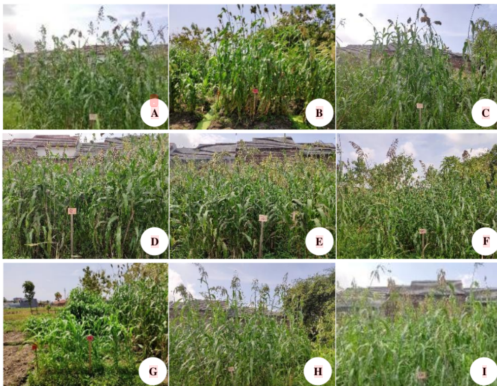
Figure 2. Plant morphology in the experimental fields: A. SG-JBG, B. SG-TBN, C. GB-PSR, D. SG-LMG 1, E. SG-LMG 2, F. SG-SPG 1, G. SG-SPG 2, H. SG-TLG 1, I. SG-TLG 2

Note: The numbers followed by the same letter in the same column show no significant difference in the 5% LSD test.