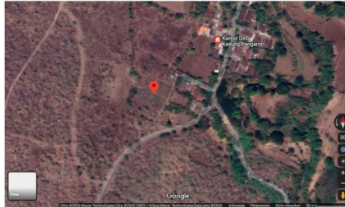
Fig. 1. Satellite map of the location of the jatropha garden collection in Pasuruan, Indonesia (Google Maps, 2020 - https://goo.gl/maps/og6iw2TkARo2CZHA7 )

The jatropha germplasm used in this study was in Krajan hamlet, Kedung Pengaron village, Kejayen sub-district, Pasuruan district, East Java. Map of Kedung Pengaron Village, the location of the garden is at coordinates 7°45'54.3"S 112°50'37.7"E