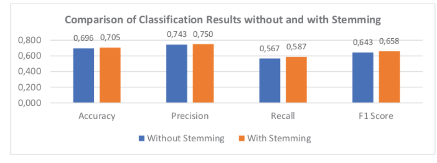
FIGURE 4. Comparison of Classification Results

The results obtained are that through the stemming process, the classification results from sentiment analysis have slightly increased in terms of accuracy, precision, recall, and F1 scores. It can be seen that the accuracy value has increased with a value of 0.705, precision of 0.750, recall of 0.587, and F1 score of 0.658. So it can be said that the stemming process can also affect the final value of the classification results.