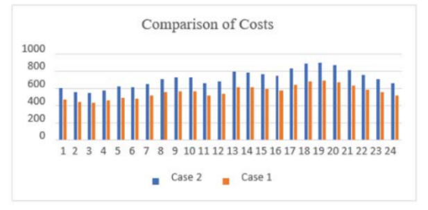
FIGURE 1. Hourly generating comparison of cost

This study utilizes the IEEE 30 bus system, having 6 thermal generator units, performed by considering carbon capture storage (CCS) and utilizing the firefly algorithm (FA) method.