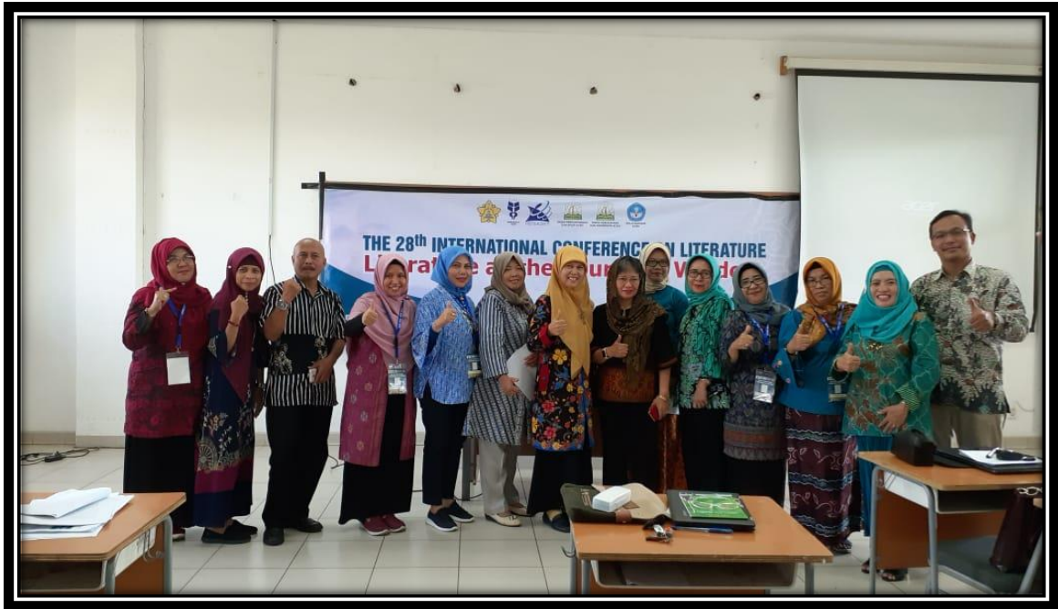
FOTO BERSAMA PEMBICARA DALAM SATU KOMISI