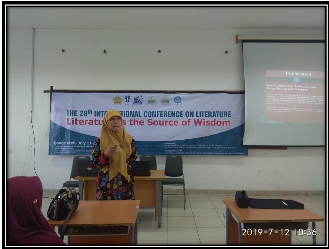
PENYAMPAIAN MATERI PADA FORUM DISKUSI PARALEL