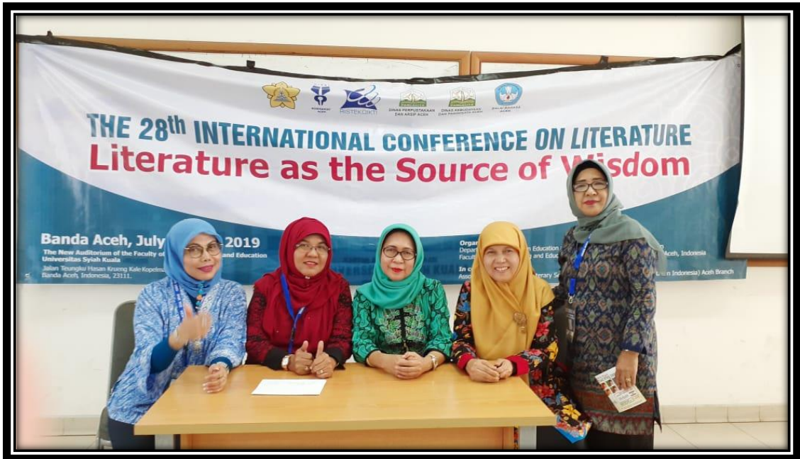
FOTO USAI PRESENTASI SESI PERTAMA