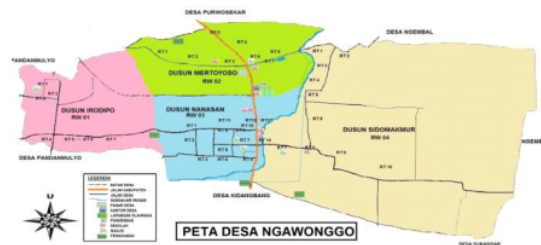
Source: Ngawonggo Village Profile Document, th 2022

minutes, while the distance to the Regency capital = 20 km, which takes about 0.7 hours. The visualisation of the administrative area of the village can be seen in the map below.