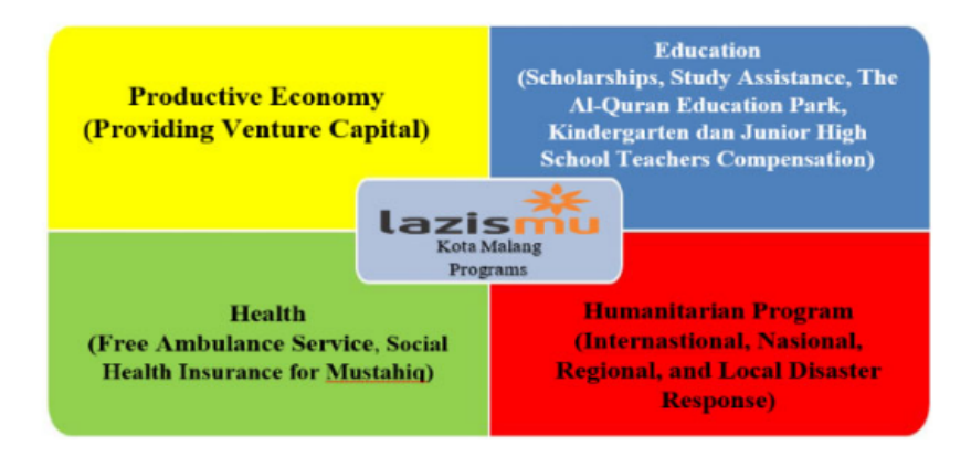
Figure 2. Malang City Lazismu regular program in utilizing Islamic Philanthropy funds.