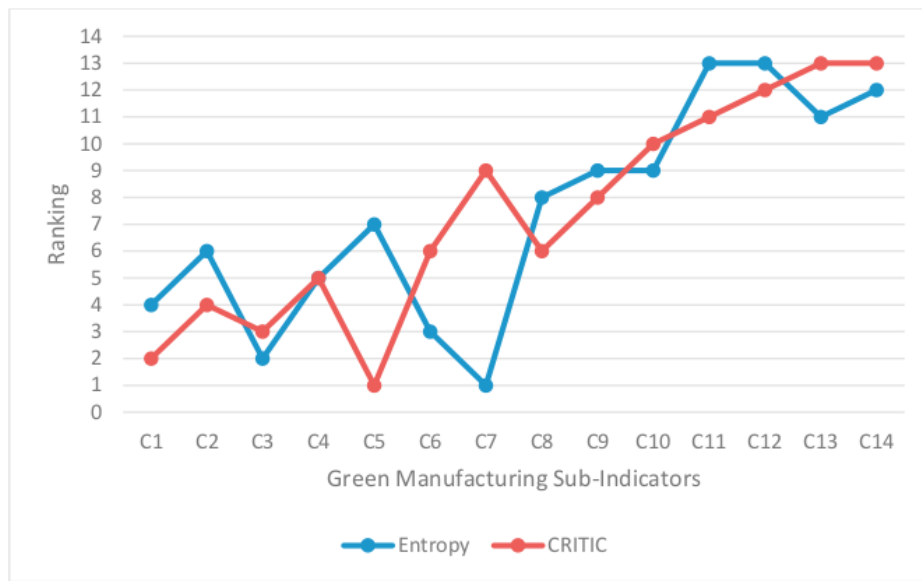
Figure 2. Ranking of Green Manufacturing Sub-Indicators

This section also provides analysis on key parameters that have an impact on the final ranking of green manufacturing sub-indicators. We perform analysis on the inputs and outputs to understand their impact on the final ranking of sub-indicators. We set the inputs and outputs according to two scenarios. In the first scenario, we set the input of the CCR-DEA model based on the weight derived from the entropy method and set the weight derived from the CRITIC method as the output. It is vice versa for the second scenario. The results of the analysis are summarized in Table 7.