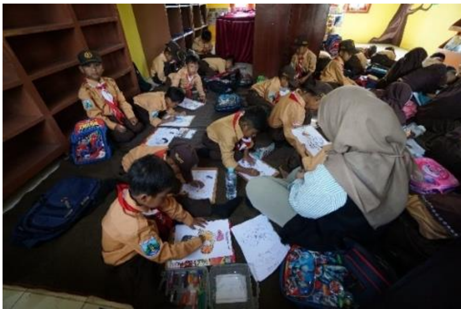
Figure 9. Activities of coloring for grades 1, 2, and 3 at SDN 1 Jambesari

Different activities are carried out by grade 1,2,3 students where they draw activities to increase their creativity (Figure 9). The pictures they colored were pictures of professions which they hoped would make it easier to internalize learning outcomes related to explanations of various professions through presentations by the team. Fun activities through coloring activities could increase students' enthusiasm to get to know more about the various kinds of professions that exist. This was in line with research's finding that fun activities for children can increase motivation or enthusiasm in the learning process. Learning with the integration strategy of using instructional media involving videos, practical activities, flashcards, colors will increase student motivation (Al Mardhiyyah et al., 2021). Students who are motivated in learning can be indicated through involvement and attachment to class, this program process run very interactively and students were able to expressively show work results and there were lively discussion situations (Piaget, 1954).