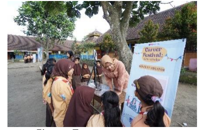
Figure 7. Content Creator