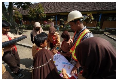
Figure 3. Architect