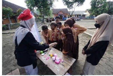
Figure 6. Chef 's