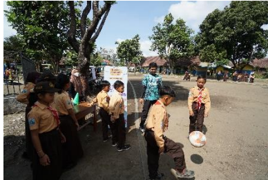
Figure 8. Athlete

Along with the implementation of career introduction in each corner for students in grades 4,5,6, there was a "career festival: my dream job" for students in grades 1,2,3 in the library hall of SD Negeri 1 Jambesari. The activities carried out were the screening of animated videos introducing various professions, from doctors, police, TNI, teachers, content creators, and other professions. In addition, there are coloring activities that aim to train the creativity of grade 1, 2 and 3 students. It is in line with the work of Farah et al (2021) who developed textbook activities for primary graders by considering kinesthetic activities as a way of attracting students' engagement. In addition, Er (2013) affirms that the use of Total Physical Responses is the best approach to teach students learn a language.