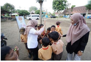
Figure 5. Doctor