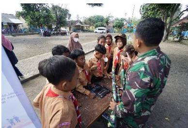
Figure 2. Army (TNI)

Students who initially did not know directly about the use of the tools used by each profession, through this activity they obtain many information about careers (Figure 2 to Figure 8), for example (ring lights, tripods for content creator profession; drafts of building drawings in the architect profession; army clothes in the civil service profession; how to present or product promotion in the entrepreneurial profession; stethoscope and thermometer in the medical profession, new knowledge related to the professionalism of a "cook" who works in hotels, restaurants, etc.; as well as direct demonstration of the tools used by football athletes). As well as information that obtained by the students, hopefully they can make a best decision for their future. Students can improve their career decision making using career guidance and counseling strategies or by alternatives services to get more information about careers (Akhsania et al., 2021).