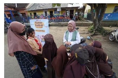
Figure 4. Businessman