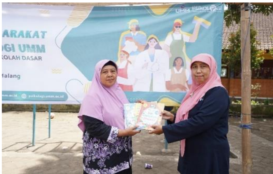
Figure 10. Giving Souvenir for representatives of SDN 1 Jambesari

After carrying out the career festival activities: my dream job, the team gave a souvenir to the school as a memento (Figure 10).