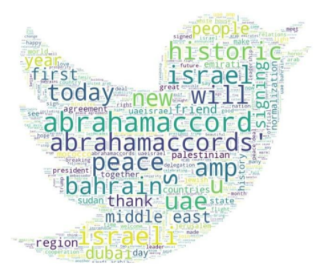
Figure 2. World Cloud Sentiment #AbrahamAccords

Based on the number of tweets obtained, there are 75% positive sentiments. Based on the diagram, about 17% of tweets have neutral sentiments, and about 8% of tweets have negative sentiments. The positive sentiment indicates that it supports the establishment of relations between the UAE and Israel. At the same time, neutral demonstrates no positive or negative sentiment value because it is not on one side. The negative sentiment indicates that it does not support the relations carried out by the UAE with Israel.