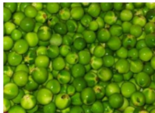
Figure 1. Turkey berry ( Solanum torvum ).

The tools used were knife, basin, aluminum pan, aluminum foil, stopwatch, ruler, 80 mesh sieve, 10 mL and 25 mL volumetric flask, Erlenmeyer, spatula, test tube, dark bottle, vial, 1 measuring pipette. mL and 5 mL, filler pipette, 1000 \mu L micropipette, 200 \mu L micropipette, yellow tip micropipette and blue tip micropipette, rubber bulb, breaker glass, thermometer, hot plate Maspion, showcase Polytron, Pioneer Ohaus PA413 analytical balance, Eutech pH meter, Konica Minolta Cr10 color reader, Multiplex Fume Hood fume hood, dryer cabinet, Philip blender, Genesys 20 thermos spectronic type spectrophotometer.