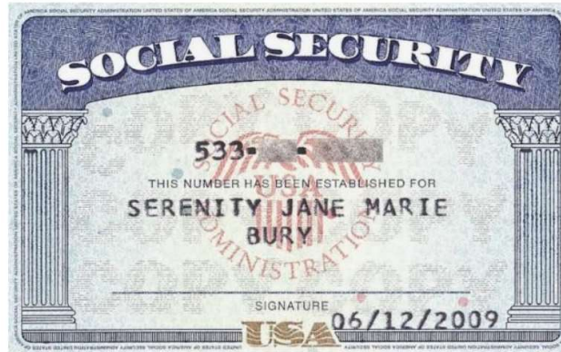
Figure 3 Source: Journal of Setiadi, H., Genia, P. I., & Hasibuan, Z. A.

individual's background and ethnicity, and the last four digits serve as the serial number. Here is an example of a Social Security Number valid in the United States. (Helard Setiadi, Puti Indah Genia, 2006)