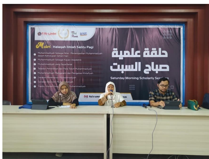
Figure 1. HISP FAI UMM Activities

Apart from that, researchers also found an academic activity in the form of a dialectical discussion once a month, which all teaching staff and FAI UMM education staff must participate in. In the researcher's observations, this activity is commonly known by FAI UMM residents as "Saturday Morning Scientific Halaqah (HISP)."