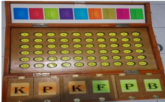
Figure 3. Dakon Koper Media

validation conducted by the fourth-grade teacher. The material expert validation obtained a percentage score of 92 % within the highly feasible category. The following is the visual of Dakon Koper media that has been made according to the prototype design.