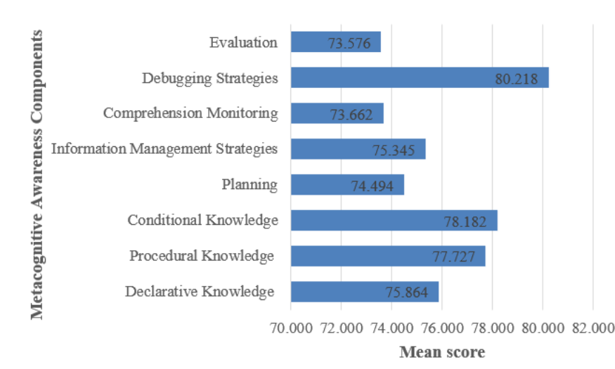
Figure 2. The profile of students' metacognitive awareness in each component

the effects of hybrid project-based learning (Husamah, 2015) and the use of Google Classroom in hybrid learning (Susilo, Kartono, & Mastur, 2019).